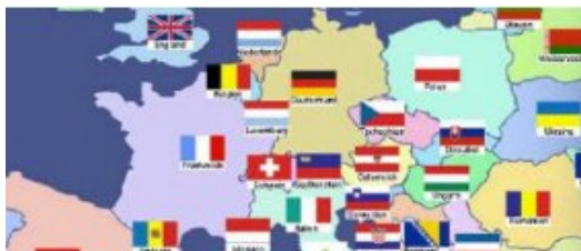
Karte/Maps elearning www.ch-info.ch

Switzerland (German: die Schweiz, French: la Suisse, Italian: Svizzera, Romansh: Svizra, officially the Swiss Confederation (Confoederatio Helvetica in Latin, hence its ISO country codes CH and CHE), is a federal republic consisting of 26 states named cantons, with Bern as the seat of the federal authorities. The country is situated in Central Europe where it is bordered by Germany to the north, France to the west, Italy to the south and Austria and Liechtenstein to the east.